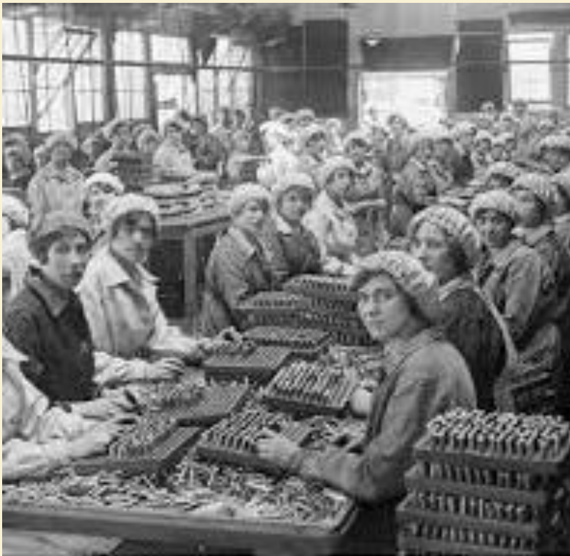
Royal Arsenal, Woolwich. Small Arms Factory 3. women workers finishing s